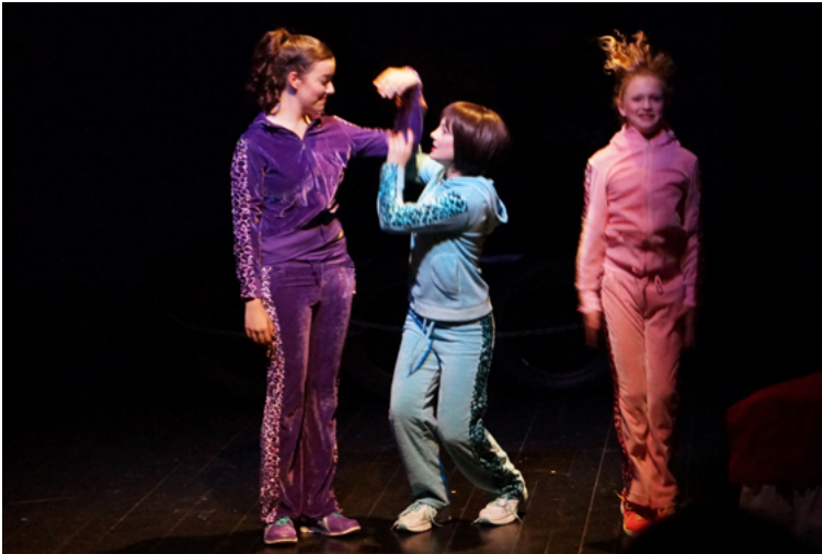
Stepmother and step sisters prepare for the dance comp in gorgeous matching tracksuits