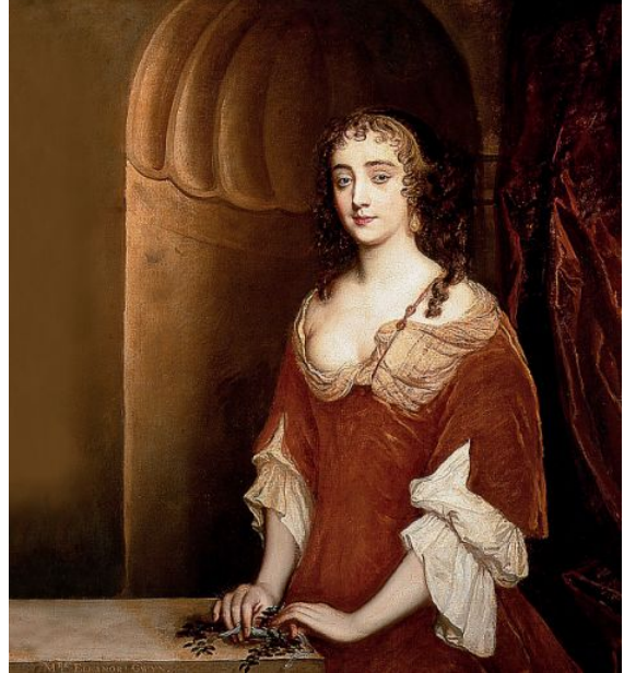
Portrait of Nell Gwyn