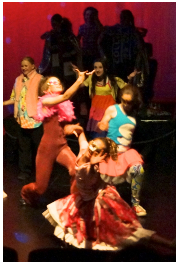
Busting the moves in the final scene of Cinderella