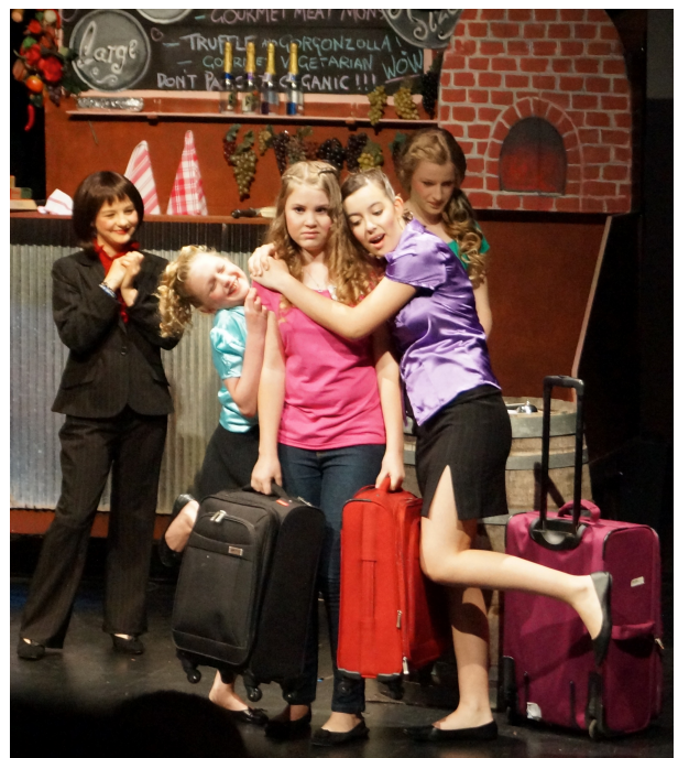
Cinderella welcomes her stepsisters to the Pizza Shop