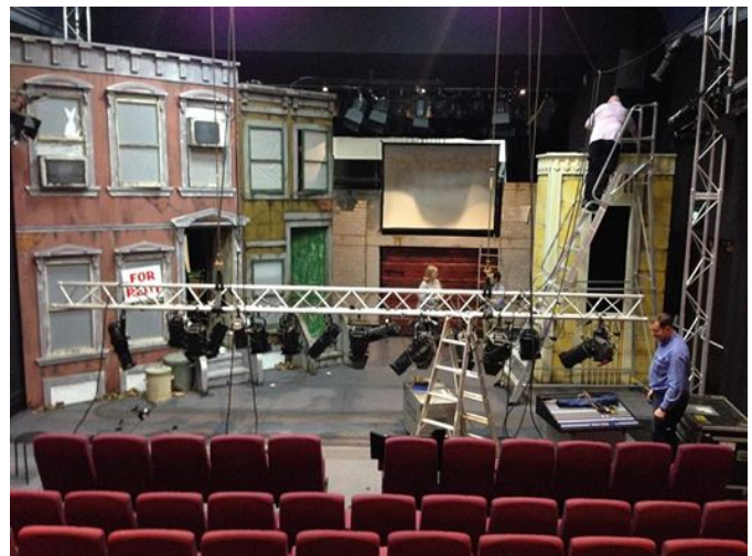
Hmm....looks like theatre to me – 3aC bump out Ave Q at the Phee earlier this year

independent companies, providing our community