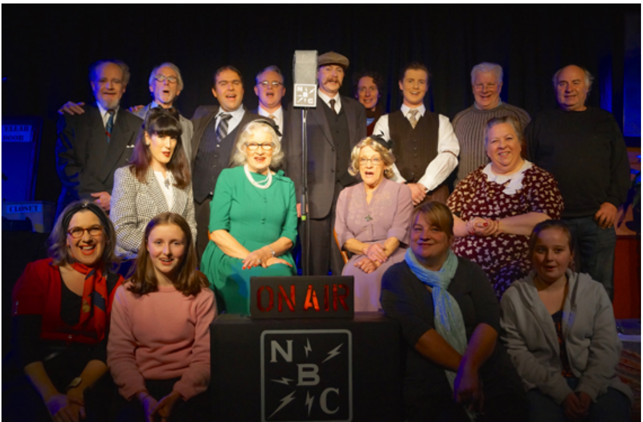
The fabulous cast and crew of Arsenic and Old Lace. Thanks to all for their contribution to a very successful production