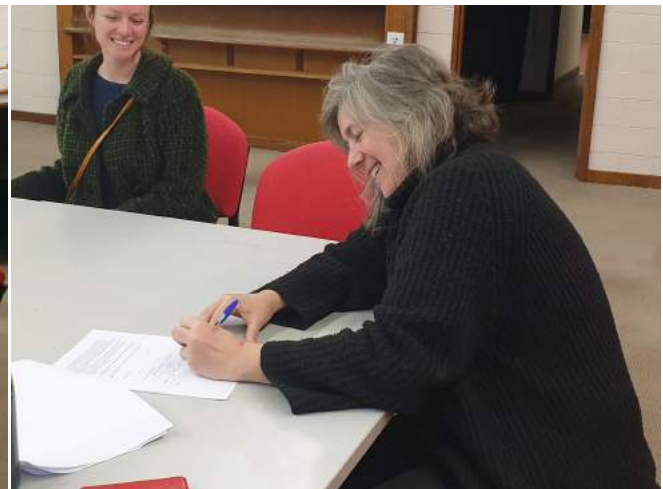
Down to the serious business of signing!