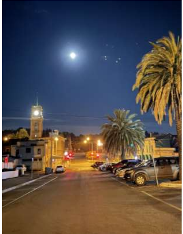
Castlemaine under a full moon