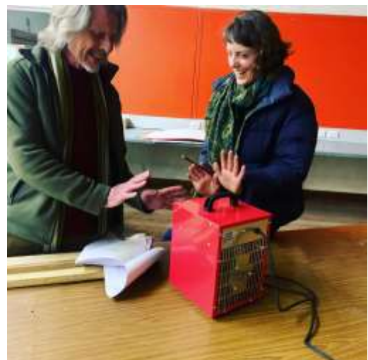
Rehearsing The Tempest ... and keeping warm between takes!