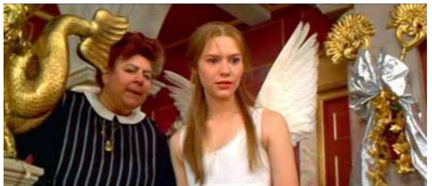
Miriam Margolyes in Romeo & Juliet