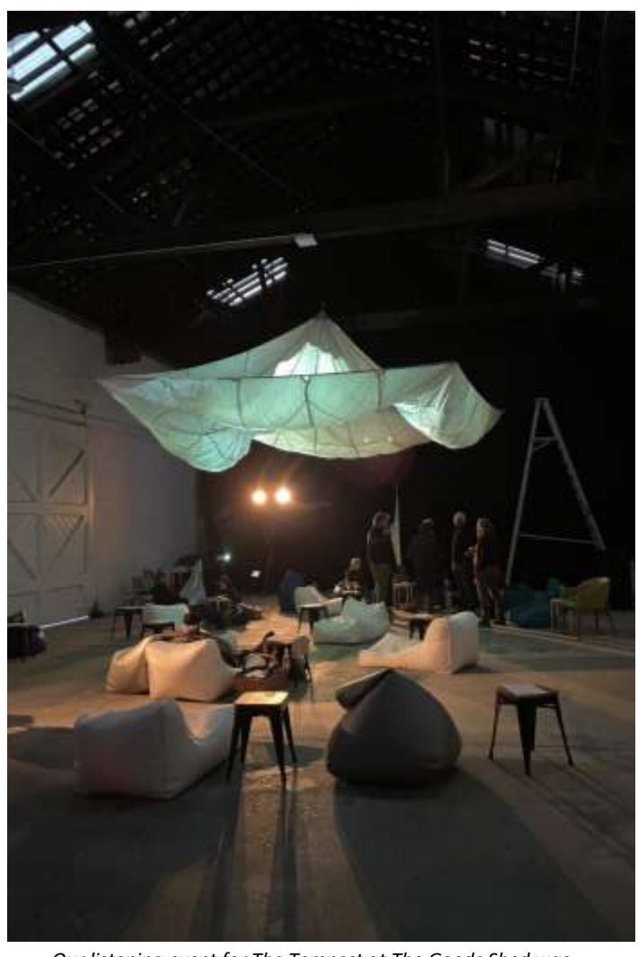
Our listening event for The Tempest at The Goods Shed was exclusive and cosy (in a socially-distanced sort of way)

The episodes were aired weekly on Castlemaine's own 94.9mainFM radio station in 2021 and now, at last, it is available to everyone to listen to on our website.